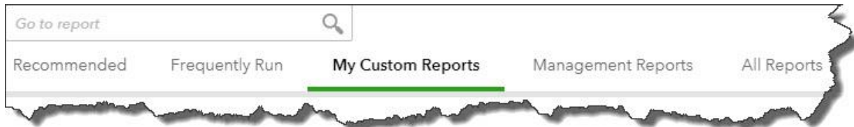
The Reports page toolbar

Note: There's one category named Accountant Reports . If you're very familiar with double-entry accounting, you might attempt to run and analyze these yourself. Most likely, you'll need some help with these critical financial reports that should be created periodically. We'd be happy to assist with this.